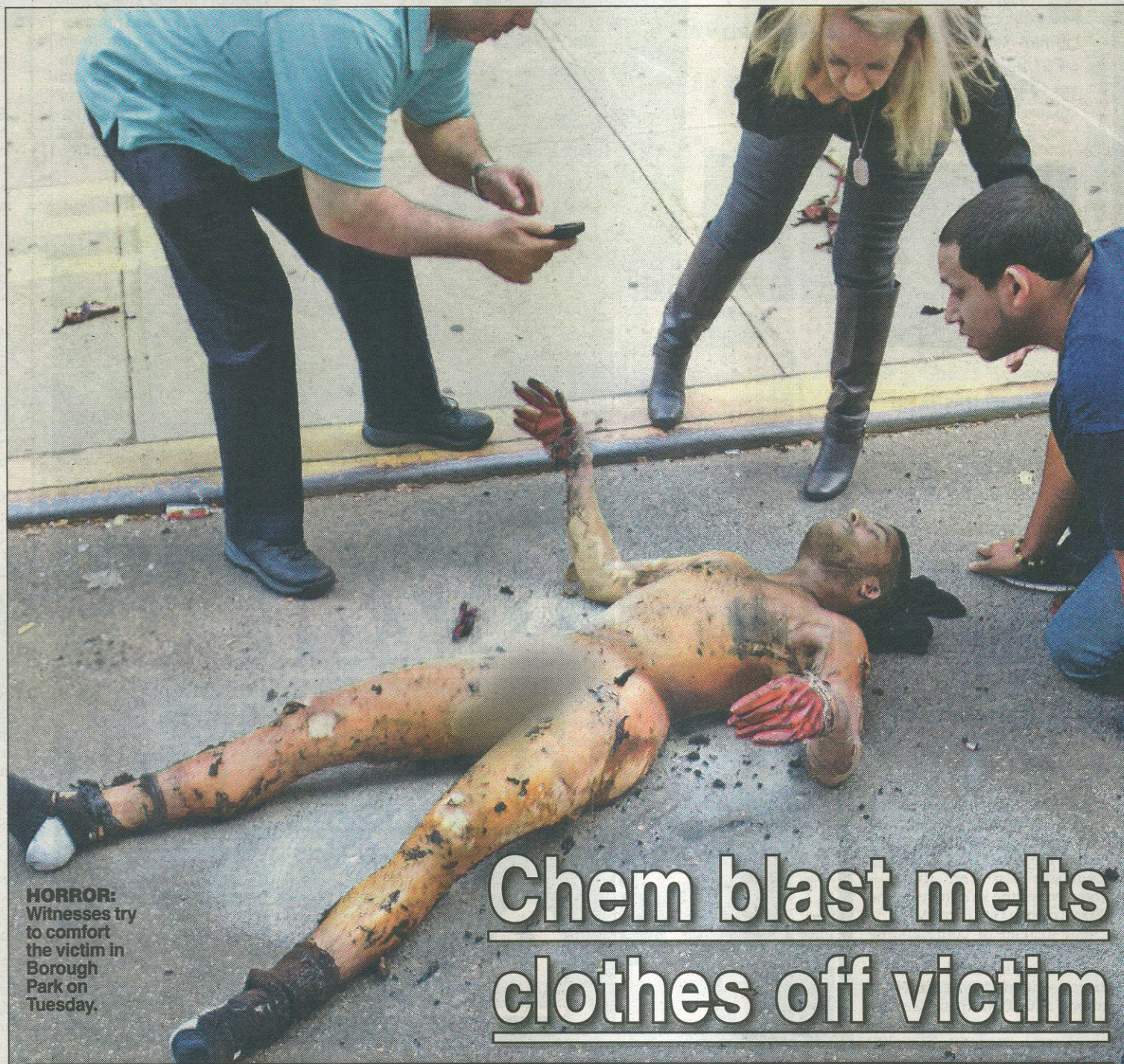
HORROR: Witnesses try to comfort the victim in Borough Park on Tuesday.