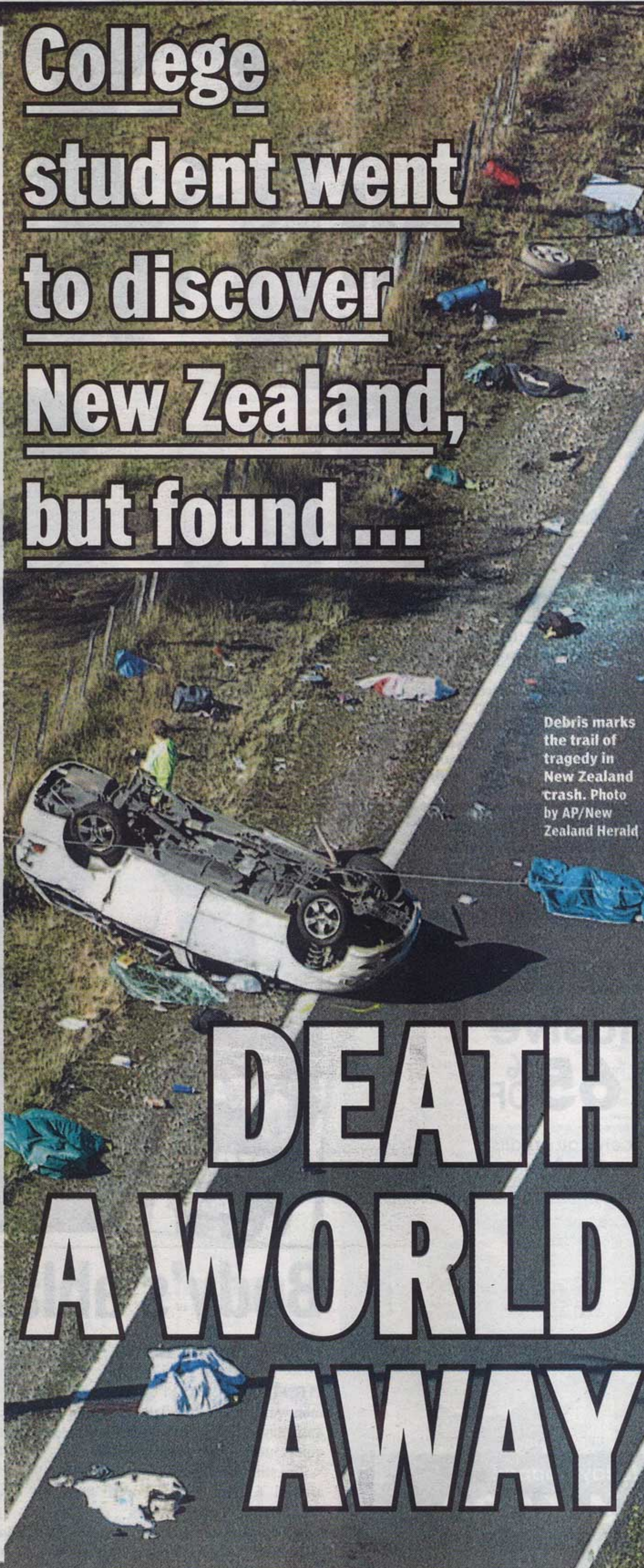
Debris marks the trail of tragedy in New Zealand crash.